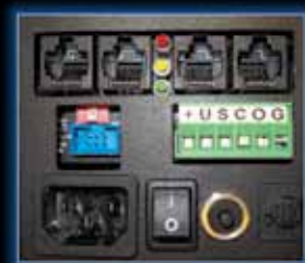
Home Automation Interface