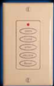
Wireless Wall Switch