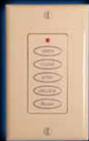
Wireless Wall Switch