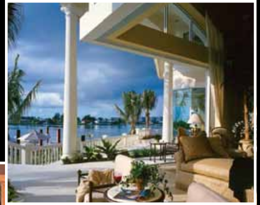
PHOTO CREDITS: PLAZA DOOR / COURTESY OF SATER DESIGN / PHOTOGRAPHER LARRY TAYLOR