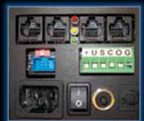
Home Automation Interface